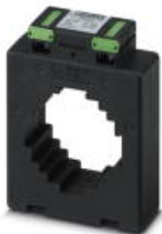
Window-type current transformer, 600 A AC primary current; 5 A AC secondary current; accuracy class 1; 10 VA rated power

Please be informed that the data shown in this PDF Document is generated from our Online Catalog. Please find the complete data in the user's documentation. Our General Terms of Use for Downloads are valid ( http://phoenixcontact.com/download )